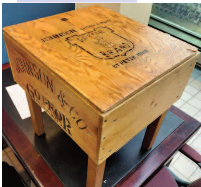
Storage table, Johnson & Company.