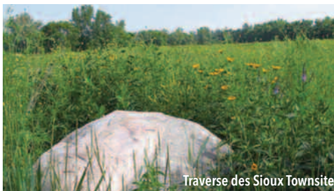
Traverse des Sioux Townsite