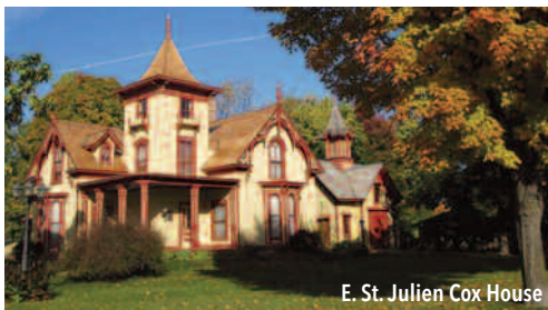
E. St. Julien Cox House

E. St. Julien Cox House • Traverse des Sioux • Treaty Site History Center