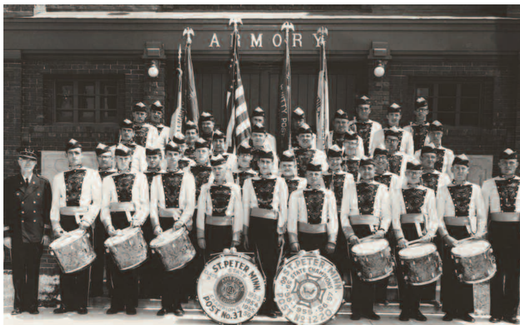
St. Peter Drum and Bugle Corps, 1960.

NCHS put the images of the photos on our Facebook page and received many helpful responses. There are still a few unidentified band members, and there are also a few individuals who were identified as two different men, or one name associated with two different people.