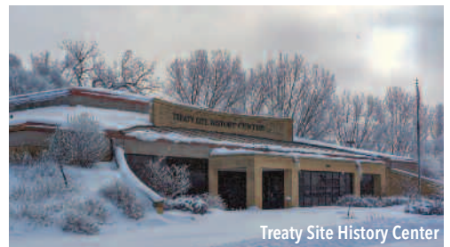
Treaty Site History Center