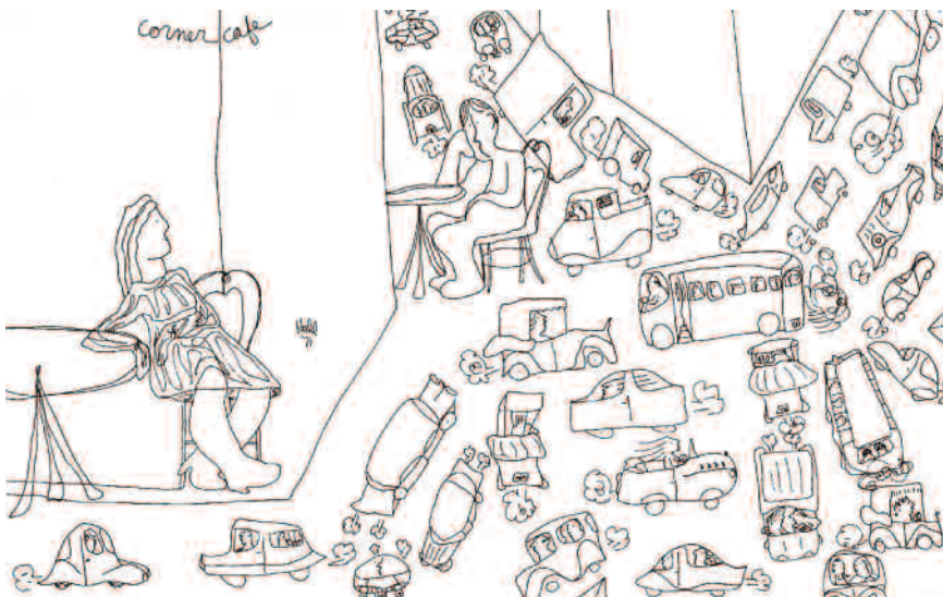
Corner Cafe by Camilla Hall.

NICOLLET COUNTY HISTORICAL SOCIETY 507-934-2160 | info@nchsmn.org