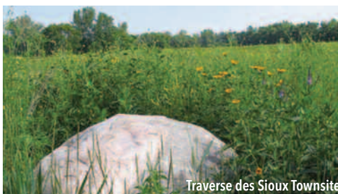
Traverse des Sioux Townsite