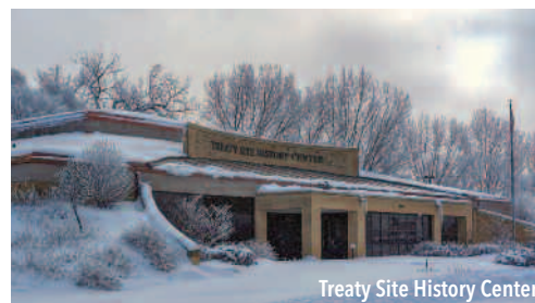
Treaty Site History Center