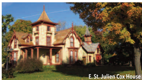
E. St. Julien Cox House

E. St. Julien Cox House • Traverse des Sioux • Treaty Site History Center