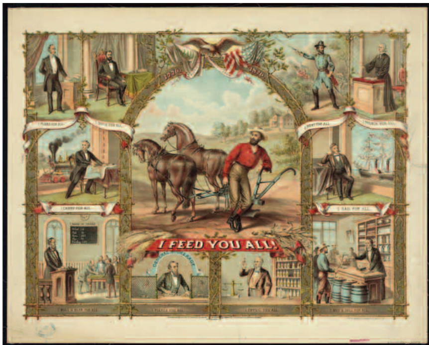
"I feed you all!" lithograph by American Oleograph Co., Milwaukee, 1875.