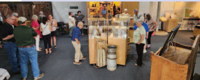
At the Celebrating the Past, Cultivating the Future preview event

Most of all, I've learned how much our community values its history. We have started our "History Hangout," a group that meets on the 3rd Thursday of each month to share memories and reminisce. We also have many new volunteers helping us organize the library, run the front desk, set up exhibits, and do other projects that need doing. We couldn't get by without their help and are always looking for more volunteers!