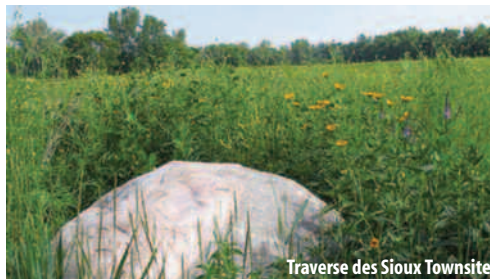
Traverse des Sioux Townsite