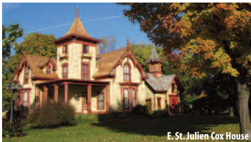
E. St. Julien Cox House