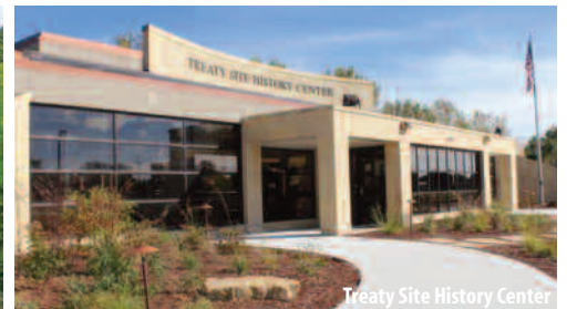
Treaty Site History Center