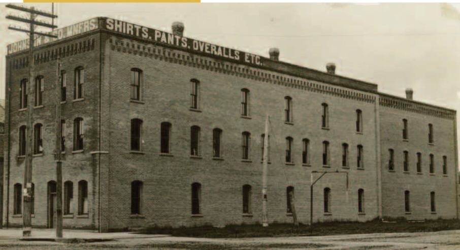
This postcard image shows the Johnson & Company building in St. Peter on the southwest corner of the intersection of Minnesota Avenue and Broadway, facing the avenue. The company made shirts, pants, and overalls. The lighter colored building was constructed in 1900 with the three-story addition added to the west in the spring of 1905.

Over these past several months, a confluence of materials associated with Johnson & Company (later Johnson Uniform Company) of St. Peter and the Johnson family has flowed into the NCHS collections from many donors near and far – as far away as Washington State!