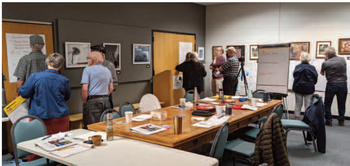
The Board works through a priority planning session during the May 7th retreat.

Our Board is an incredible, active, engaged, and creative group of individuals crafting a roadmap for the future of NCHS. I invite communication with our members regarding how we are doing and what you would like us to consider for the future. Feel free to drop me a line at board@nchsmn.org . Your input is important to me!