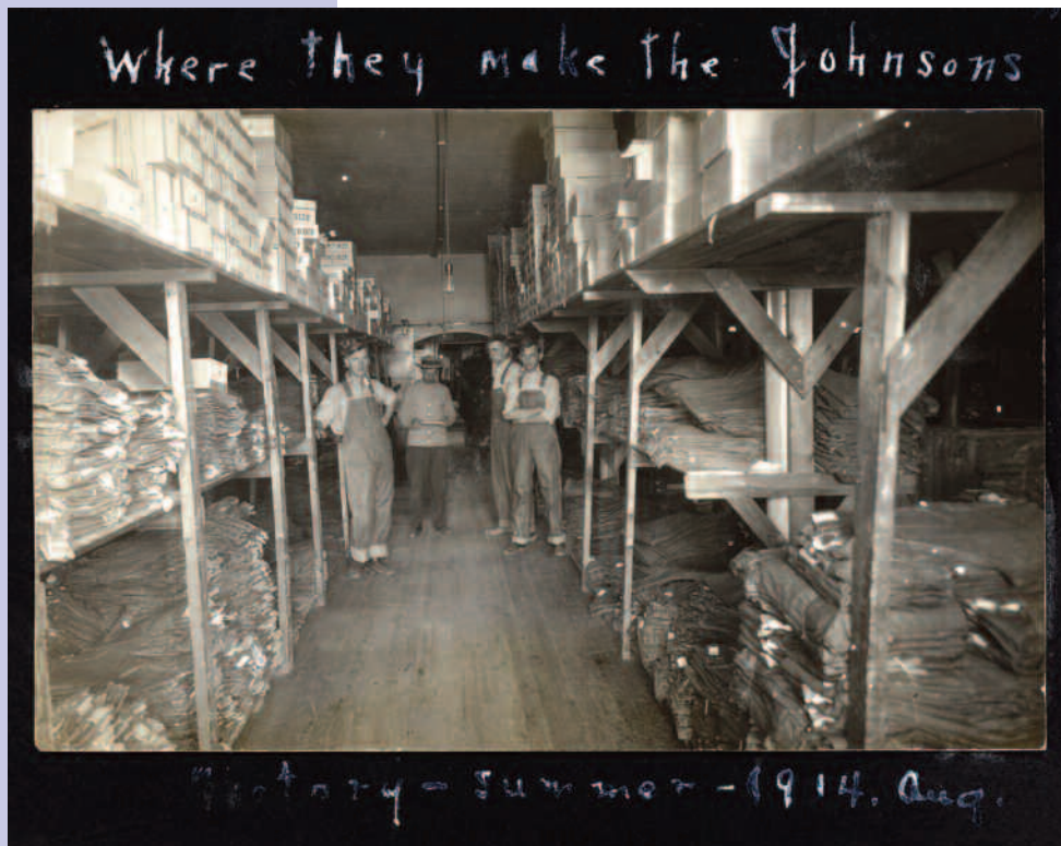
Storage room, Johnson & Company, 1914.