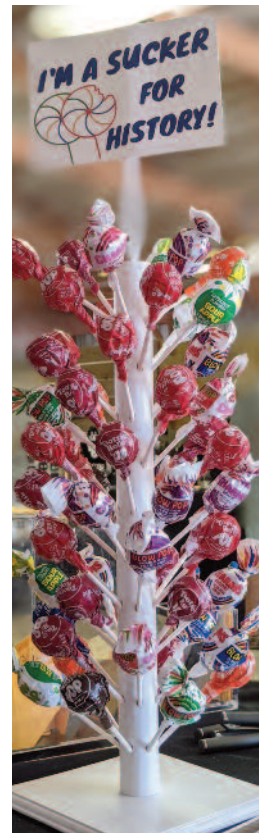
The sucker tree was a big draw for kids of all ages at the Nicollet County Fair.

neighbors, family & friends joined to support preserving history in Nicollet County