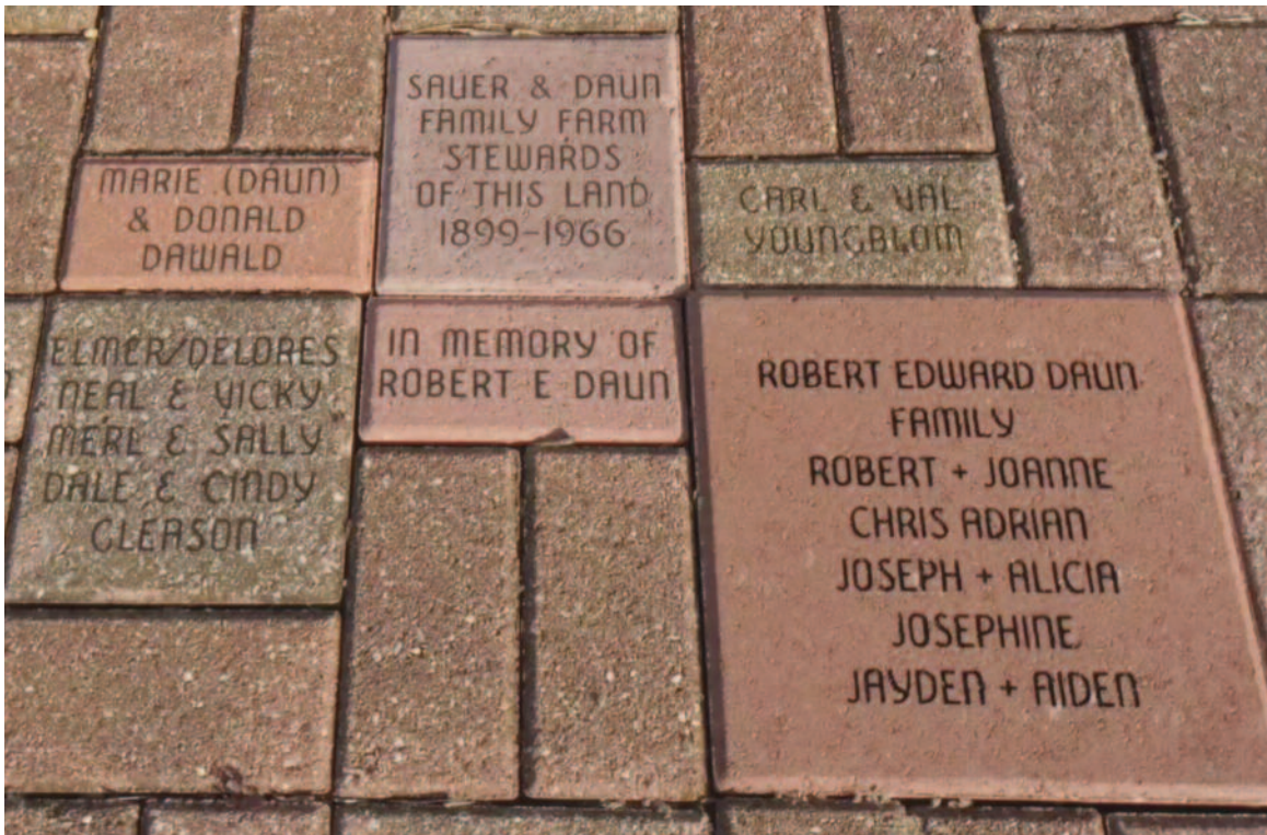
New Daun Family memorial bricks were installed on the patio.