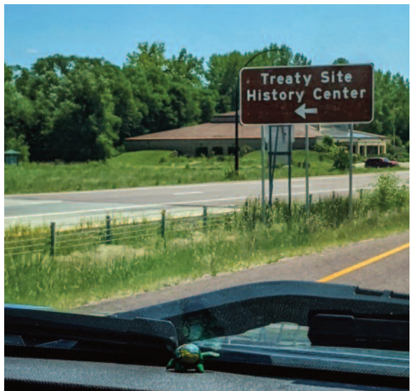
New wayfinding signs were installed by MNDOT this summer.