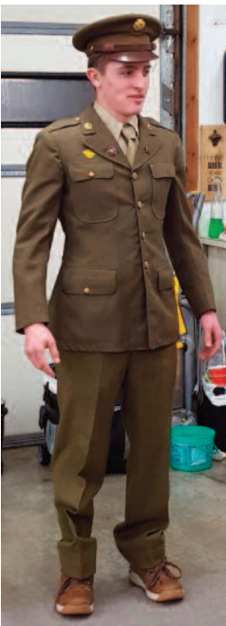
Examples on this page of 2021 Collections donations to the Nicollet County Historical Society.