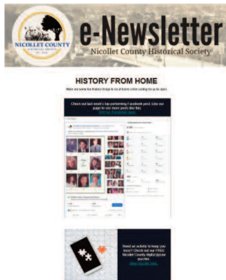
the way we share history moved online—focused on social media, email, and the website...