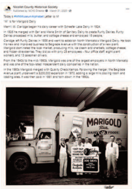
we participated in the #MNMuseumAlphabet challenge in the spring...