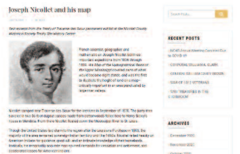
and we shared blog stories...