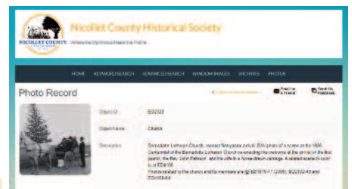
... and research continued.