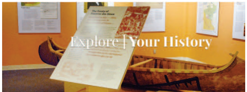
we upgraded our website in July, adding new stories, resources, and ways to connect with history...