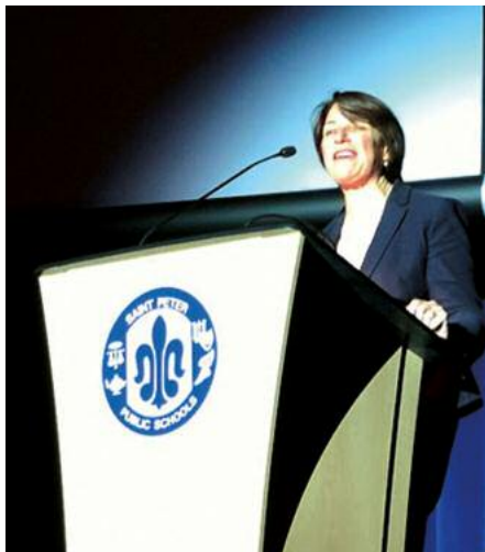
Twist of Fate event in the Saint Peter High School Auditorium, including visiting speaker, Sen. Amy Klobuchar