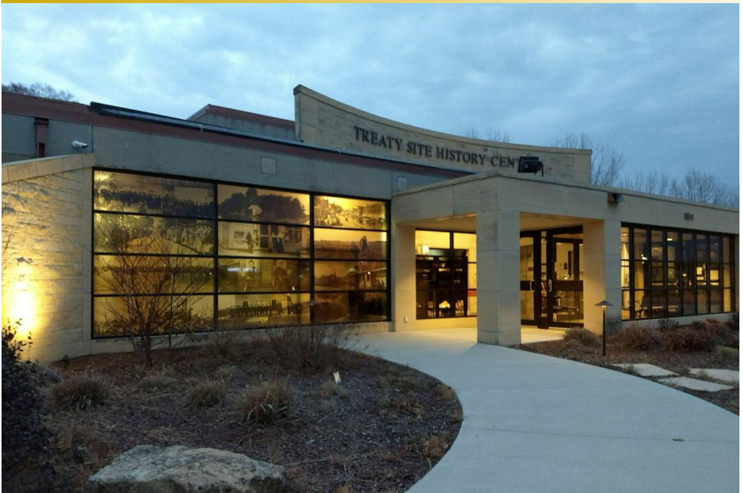
Treaty Site History Center, in the early morning. Celebrating 25 years in this building.