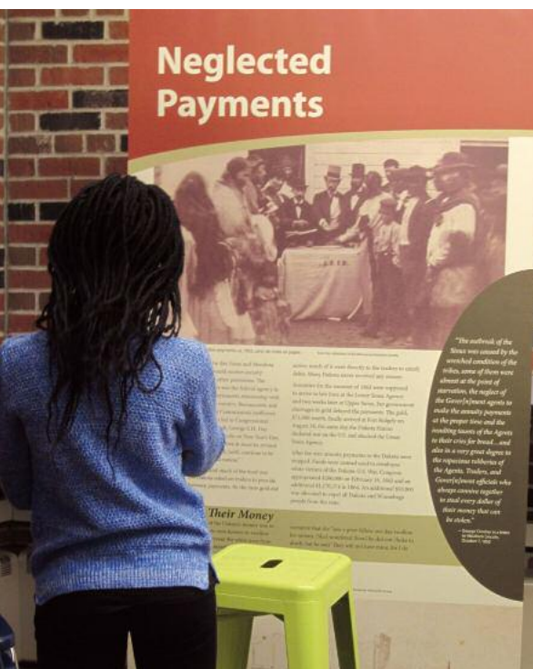
This fall students at Chaska Middle School West explored NCHS traveling exhibit "Commemorating Controversy: The U.S. Dakota War of 1862."