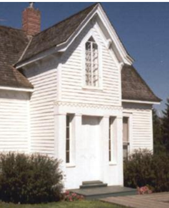
W. W. Mayo house, Le Sueur