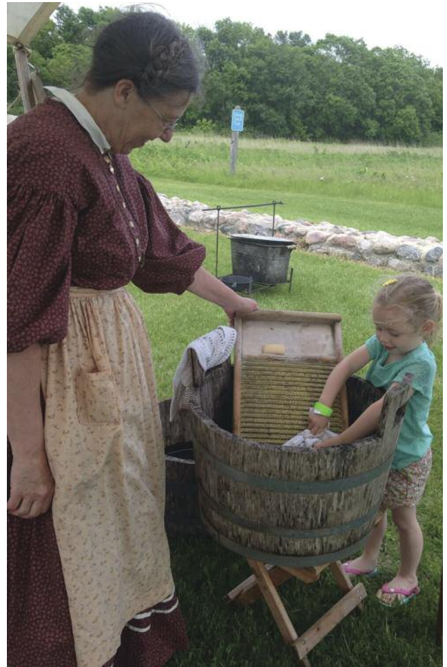
Fort Ridgely, Company B Weekend, with a child learning the rigors of fort life.