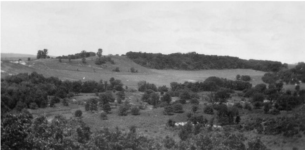
Minnesota River Valley near Courtland.