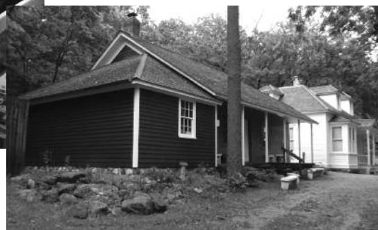
Left: TSHC Central Exhibit which was the focal point of the educational DVD project completed in 2011