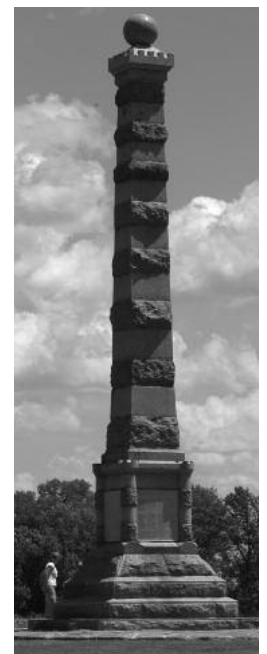
Rigtt: Fort Ridgely Monument