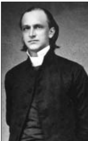
Bishop Henry Whipple

He founded the Episcopal cathedral in Faribault, first cathedral of any denomination in the United States, as well as the Shattuck and St. Mary’s schools and Seabury Seminary. He worked for Queen Victoria in Hawaii and among the Seminole Indians in Florida. His parish church at the Lower Sioux reservation is active to this day.