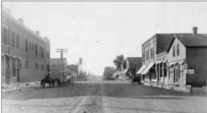
from top down: Pine Street looking South 18??; Pine Street looking North 18??; Third Street looking West 18??.