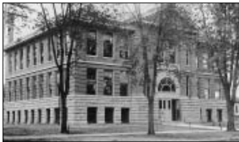
Left top to bottom: Central School, St. Peter; Old High School, St. Peter; Oshawa Twp. School Dist. #52; center: Homer School, Swan Lake; the second Lincoln School, St. Peter; right: Nicollet School; the original Lincoln School, St. Peter; Washington School, St. Peter.

a salute to those noble homes of education which have passed