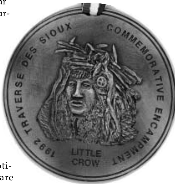
Commemorative Medallion issued in 1992 honoring Little Crow. (Shown actual size.)

The medallion for year 2001, commemorates the 150th anniversary of the signing of the Treaty of Traverse des Sioux by showing the Treaty Site History Center building on the obverse side.