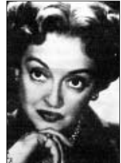
Bette Davis stars in Stranded

4 p.m. in the Gustavus Adolphus College Jackson Campus Center. The program, dinner and business meeting is $15 for members and $20 for non-members.