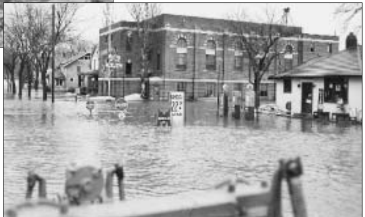
Municipal building on Belgrade Avenue.