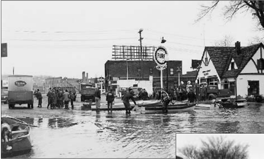
Belgrade Avenue near the river.

During the winter of 1951 southern Nicollet County received 88 inches of snow. A quick spring thaw spelled disaster. Unable to keep up, the Minnesota River rose to 26 feet four inches, spilled over its banks and flooded 40,000 acres. North Mankato, the hardest hit community, suffered $3 million damage. In today's dollars that would be over $21.8 million.