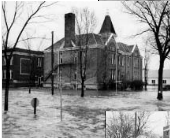
Old school (now Bell Tower Apartments) on Belgrade Avenue.