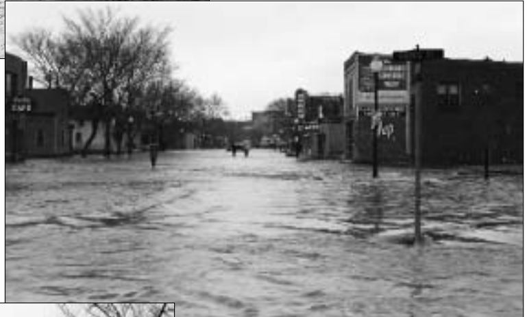
Business district on Belgrade Avenue.